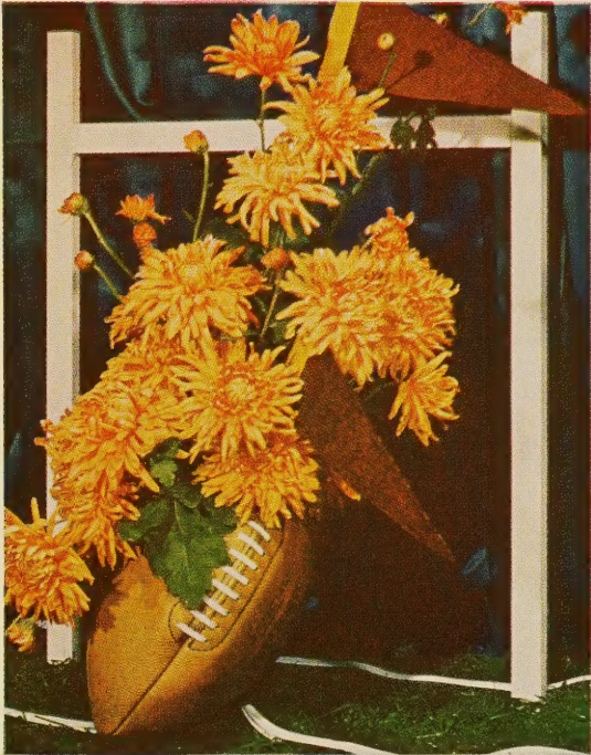
FOOTBALL BRONZE. $1.00 each; 3 for $2.50